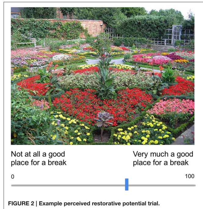
FIGURE 2 | Example perceived restorative potential trial.

Within-participants, perceived restorative potential significantly correlated with visual appeal ( r = 0.60, p < 0.001 ), naturalness ( r = 0.43, p < 0.001 ), and informality ( r = 0.44, p <